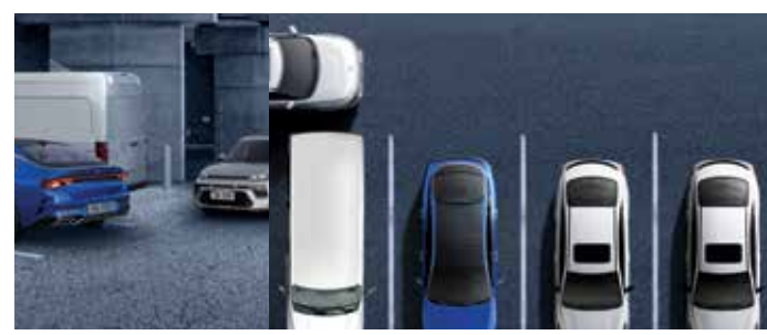
Rear Cross-Traffic Collision Warning (RCCW) The RCCW radars detect the presence of cross traffic in the lane the K5 is backing into. If a vehicle is detected on either side, an audible warning will sound, and a cluster warning graphic will illuminate, until the path is clear.