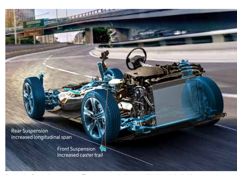
Suspension System Improvements The rear suspension's arm position is optimized with an increased longitudinal span. At the front, the caster trail is increased for better wheel recovery after cornering. As a result, the K5 is more responsive and agile, as well as more fun to drive.