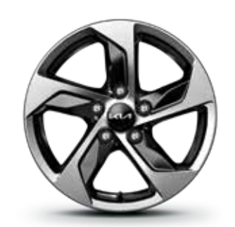
205/65R 16" Alloy Wheel