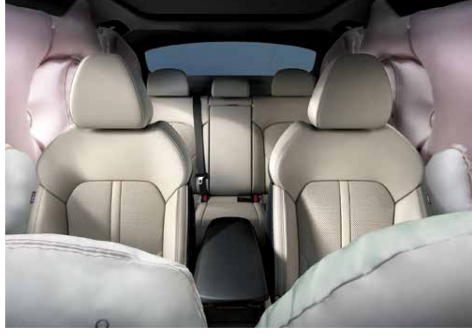
6 Airbags To help protect occupants and reduce injury in a collision, the K5 is equipped with driver and front passenger airbags, two front-side airbags, and two side-curtain airbags.

The completely re-engineered K5 rides on an all-new platform featuring advanced structural enhancements that not only ensure unsurpassed collision protection but also more refined, yet exciting driving dynamics. State-of-the-art active and passive features work together seamlessly to deliver the highest levels of safety for all vehicle occupants; and as the new third generation platform is shared with other Kia models, it benefits from economies of scale and an ever-expanding knowledge base.