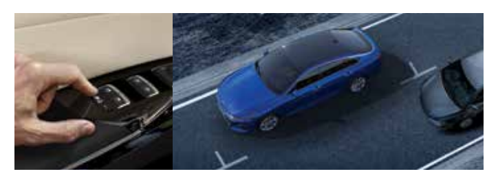
Safe Exit Assist (SEA) Using the K5's rear corner radar, SEA detects cars approaching from behind and cautions passengers who may intend to exit the vehicle. SEA will even override Electronic Child Safety Lock settings until the approaching vehicle has passed.