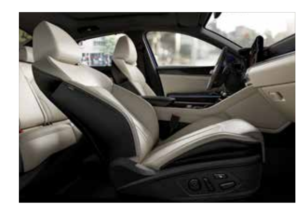
Relaxation Comfort Seats

A long wheelbase gives the K5 interior surprisingly generous legroom, and the sweeping roofline, in tandem with a lower cabin floor, creates ample headroom and shoulder space. Available in leather, the firm seats provide ample support. Poweradjustable front seats (8-way for the driver, 4-way for the passenger) include 2-way power lumbar support, while heating and ventilation are also available.