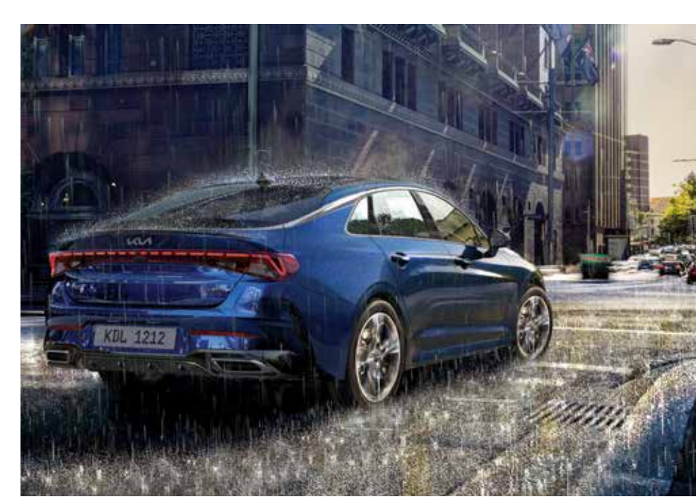
Vehicle Stability Management (VSM) VSM helps protect you and your passengers by continuously monitoring road conditions and automatically controlling the steering and brakes when the road gets bumpy.