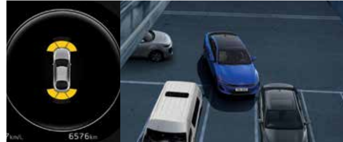
Parking Distance Warning (PDW) For utmost confidence and peace of mind when maneuvering into and out of tight parking spaces, PDW uses ultrasonic sensors mounted on the front and rear bumpers to warn you of any nearby obstacles.