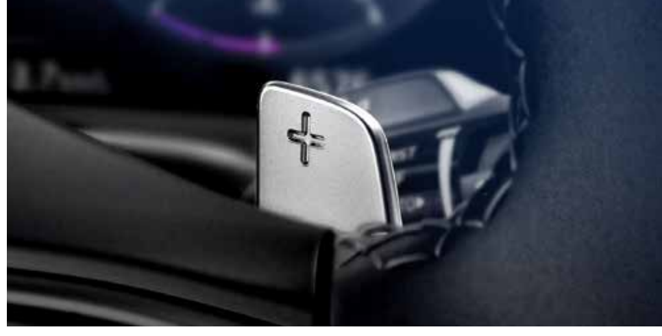
Paddle Shift Levers Instantly access more torque or choose your own shift points for the 8- or 6-speed automatic transmission without having to take your hands off the steering wheel.

Both of the automatic transmissions available on the K5 offer sophisticated shifting patterns that combine smoothness with the power to accelerate. But you can also take charge for a more intimate connection to the driving experience by using the column-mounted paddle shifters to choose your own shift points for the 8- or 6-speed automatic. You're in control whenever you want to be.