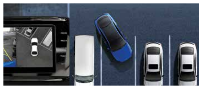
Surround View Monitor (SVM) When operating in confined spaces, multiple cameras provide you with a zoomable, 360° overhead view of the vehicle's surroundings, so you can maneuver with confidence and without having to get out of the vehicle.