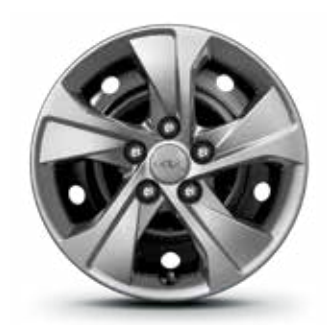
205/65R 16" Steel Wheel Cover