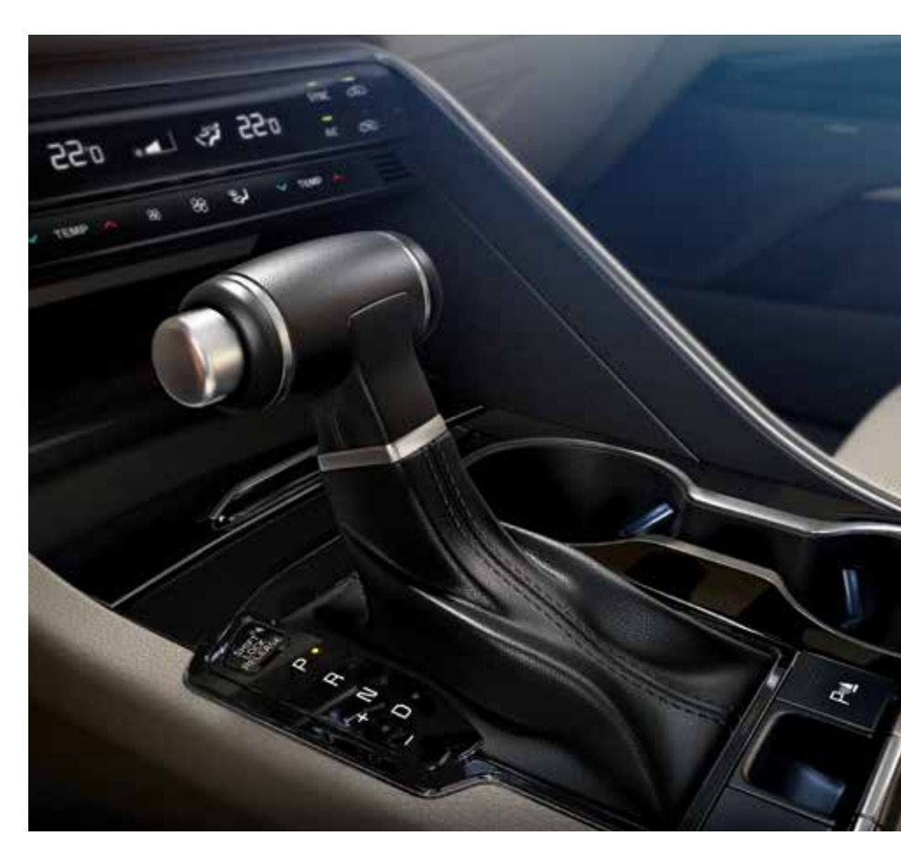
8- or 6-speed Automatic Transmission Sophisticated automatic transmissions offer remarkable smoothness as you accelerate, and give you the freedom to select your own shift points using the paddle shift levers or the gear selector itself for more spirited driving.