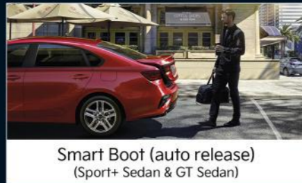
Smart Boot (auto release) (Sport+ Sedan & GT Sedan)