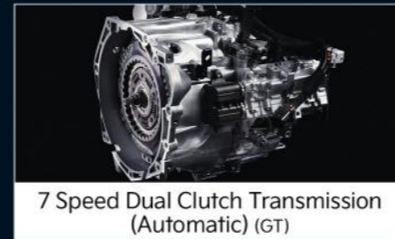
7 Speed Dual Clutch Transmission (Automatic) (GT)