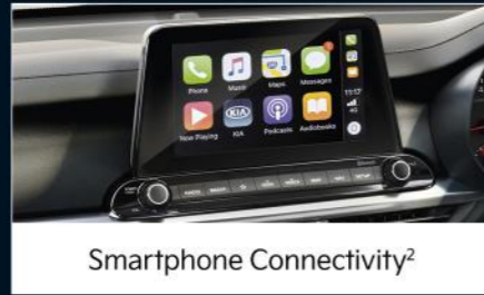
Smartphone Connectivity 2