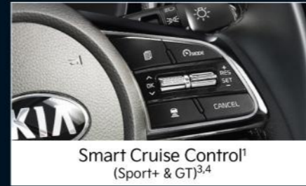
Smart Cruise Control 1 (Sport+ & GT) 3,4