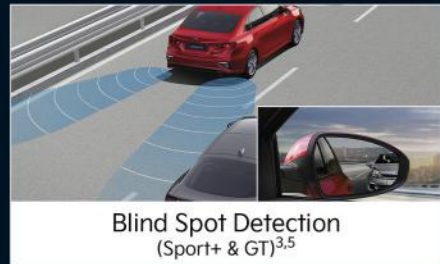
Blind Spot Detection (Sport+ & GT) 3,5