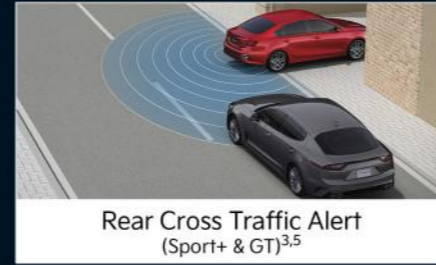
Rear Cross Traffic Alert (Sport+ & GT) 3,5