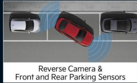
Reverse Camera & Front and Rear Parking Sensors