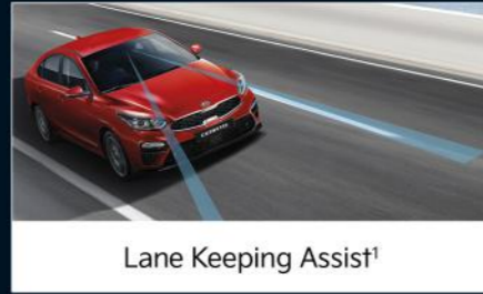
Lane Keeping Assist 1