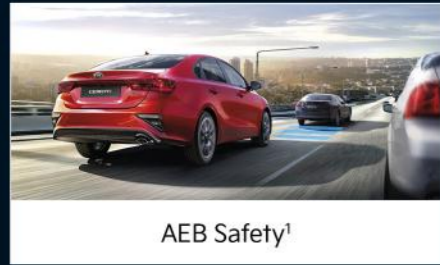
AEB Safety 1